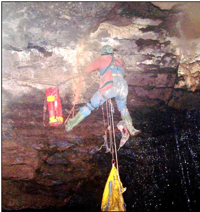
Toby on the rope and harness crossing, 'Footloose Traverse' 10 m up at the top of Waterfall Chamber. TS